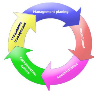
Basic functionalities of the HRM module